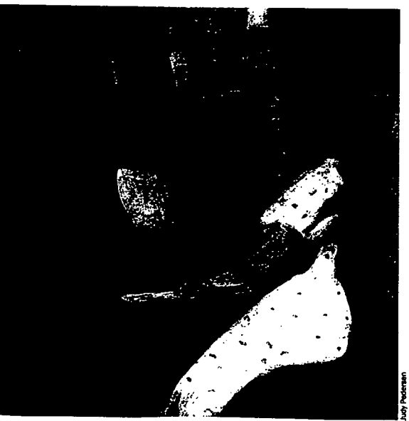
MARCH 1993 # 53

Many rural elderly fear institutionalization and wish to continue living independently in the community.