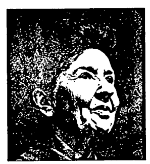
by Ellen Winston*

Homemaker-home health aide service, in all of its aspects, helps all kinds of older adults, including the single adult living alone. Its goal is to help older adults with some type of social or health problem to remain in their own homes or return to their homes after specialized treatment, when that is the best plan, and to foster as much continued independent functioning as their capabilities permit. The service may prevent unnecessary institutionalization of at least delay care in an institutional setting.