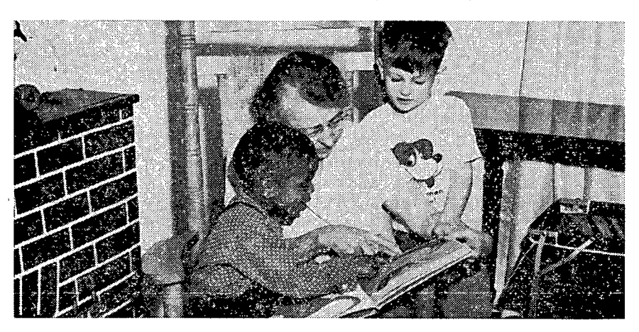
HUBBARD HOSPITAL, NASHVILLE, TENN.

METROPOLITAN CHILDREN'S HOMES, NASHVILLE, TENN.