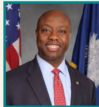
TIM SCOTT South Carolina RANKING MEMBER

Learn more about the Committee at aging.senate.gov