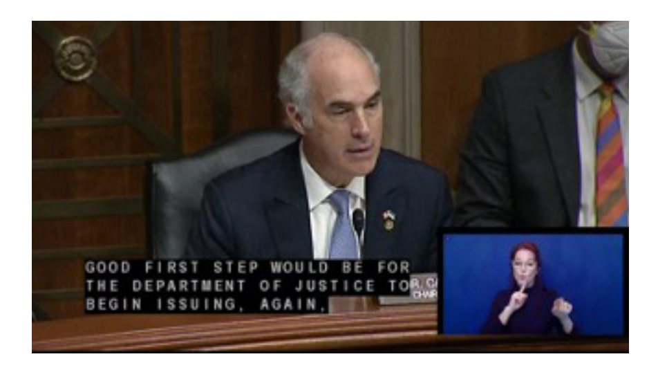
Figure 8: The image above is an example of an online video with captions and ASL interpretation.

Captions and Sign Language: Online videos must have synchronized captions of speech and other important audio content for people who cannot hear the audio.<sup>100</sup> Transcripts can help users unable to listen to a video's audio or see the video.<sup>101</sup> American Sign Language (ASL) interpretation is more effective in making videos accessible for users who primarily communicate through ASL.<sup>102</sup> Figure 8 is a screenshot of a video with captions and ASL interpretation.