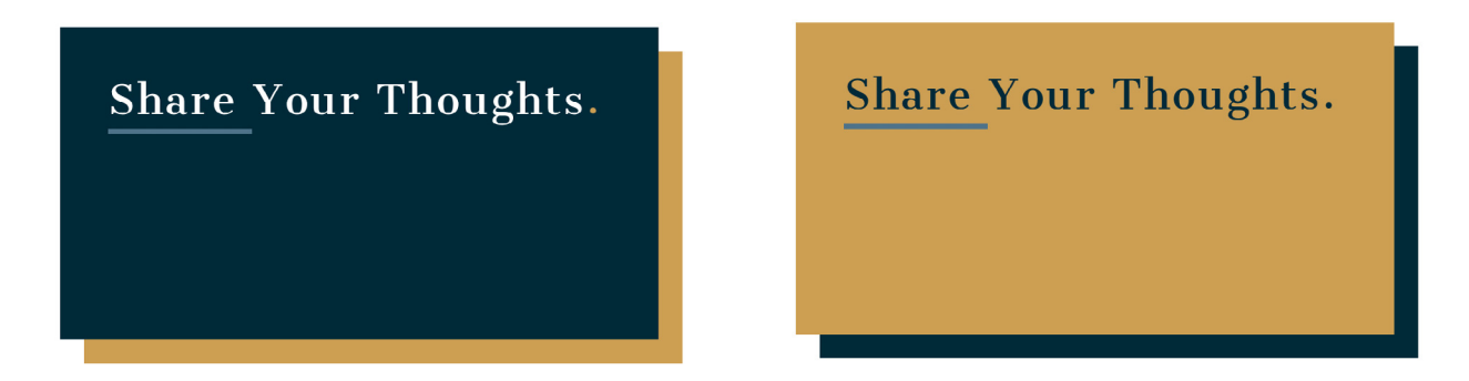
Figure 2: The images above demonstrate hover effects. The image on the left shows how this link appears when the cursor is not focused on it. The image on the right shows how the link appears when the cursor is hovering over it.

Hover Effects: Visual effects such as background glows, drop shadows, color changes, or underlining are visible when the mouse hovers over links.<sup>83</sup> These hover effects may be the only way to let the user know that text is an active link to more information.<sup>84</sup> To be accessible, the information provided by hover effects must not only be available to people using a mouse, but also other kinds of devices that can focus on the link, such as a keyboard.<sup>85</sup> Otherwise, a screen reader user, or other person relying on only a keyboard, may have trouble navigating a website. Figure 2 provides an example of hover effects.