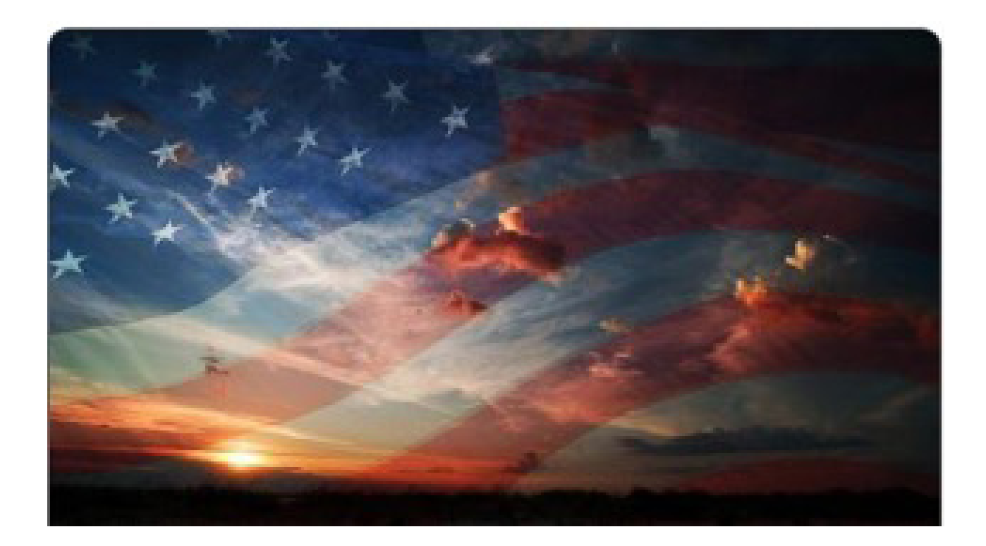
Figure 1: The alternative text that screen reader devices will read aloud for the picture above is "American flag silhouetted against the sky."

Alternative Text: Assistive technology, particularly screen readers, cannot interpret images unless accompanied with descriptive text. Images need to have text alternatives (also referred to as "alt-text") that provide descriptive identification or a text equivalent for information contained in the image, or the image's function.<sup>82</sup> This alt-text can then be read by assistive technology. Figure 1 provides an example of alternative text.