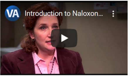
This video demonstrates how to introduce the topic of naloxone to people with opioid use disorders.

Opioid Overdose Education and Naloxone Distribution Videos: