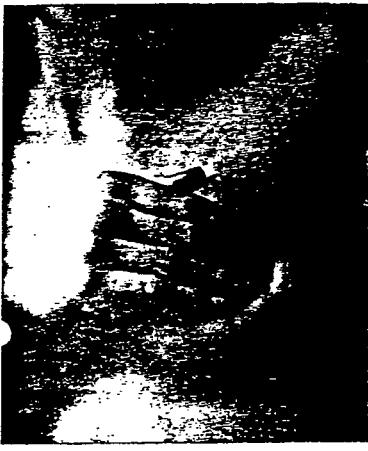
'After destroying the malignant tumor, we expected to see a holicy breast that would require an implant and plastic surgery instead we were surprised to see the growth of new healthy tissue where the once malignant bissue had been.'

"So," explains Hoffman, "we recommend that