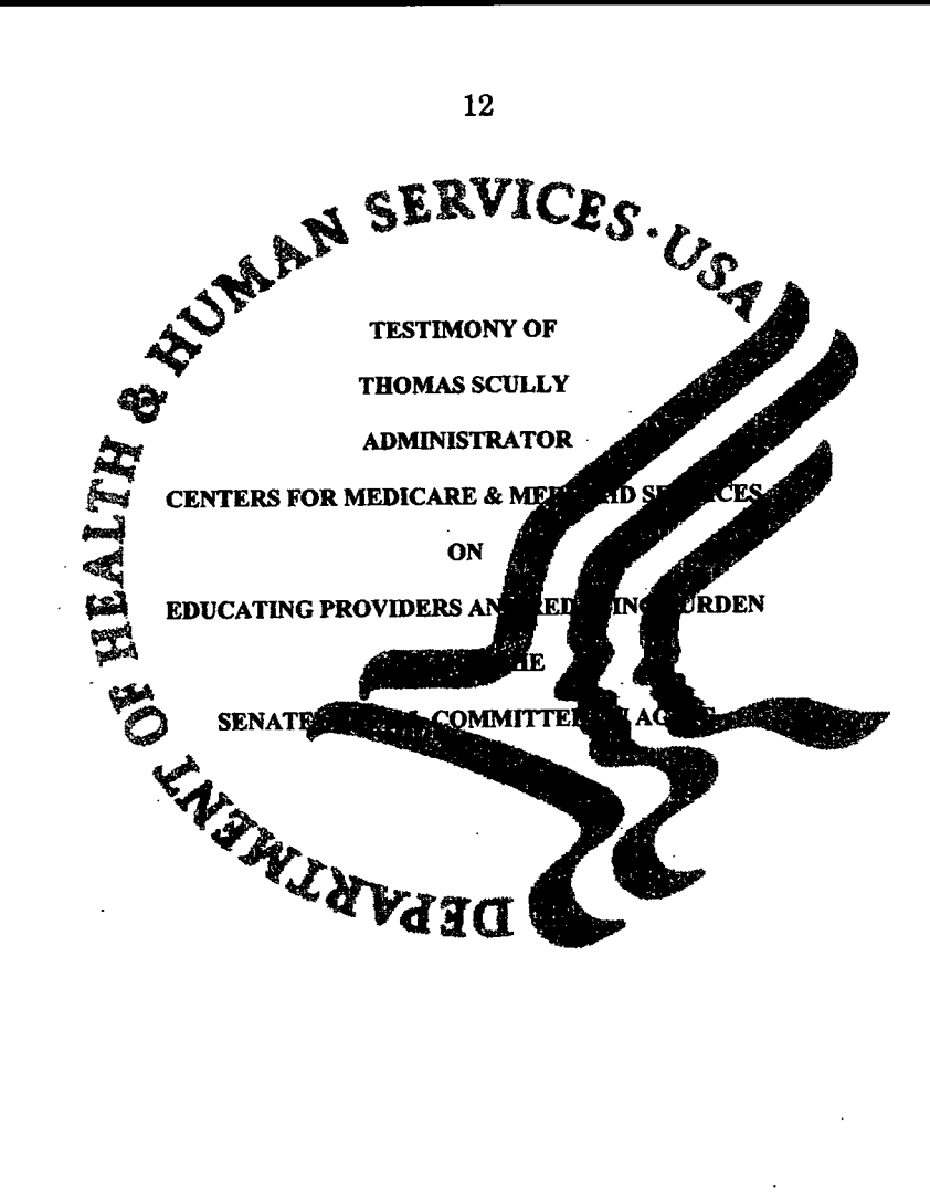
July 26, 2001