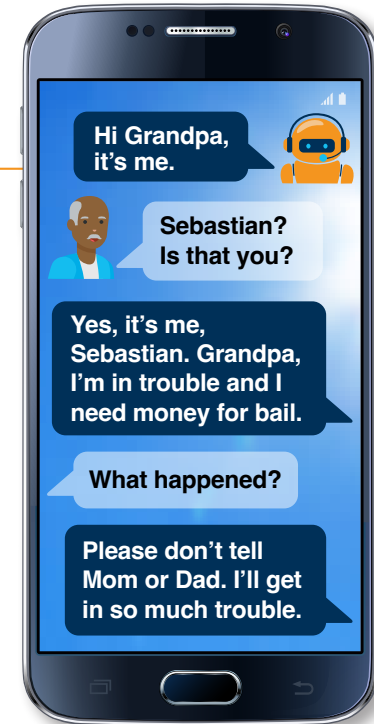
Fake Family Emergency Scam

It may be difficult to know if someone is using AI-technology in a scam. One thing is certain: AI makes traditional frauds and scams easier to deploy on a large scale and are all the more convincing.